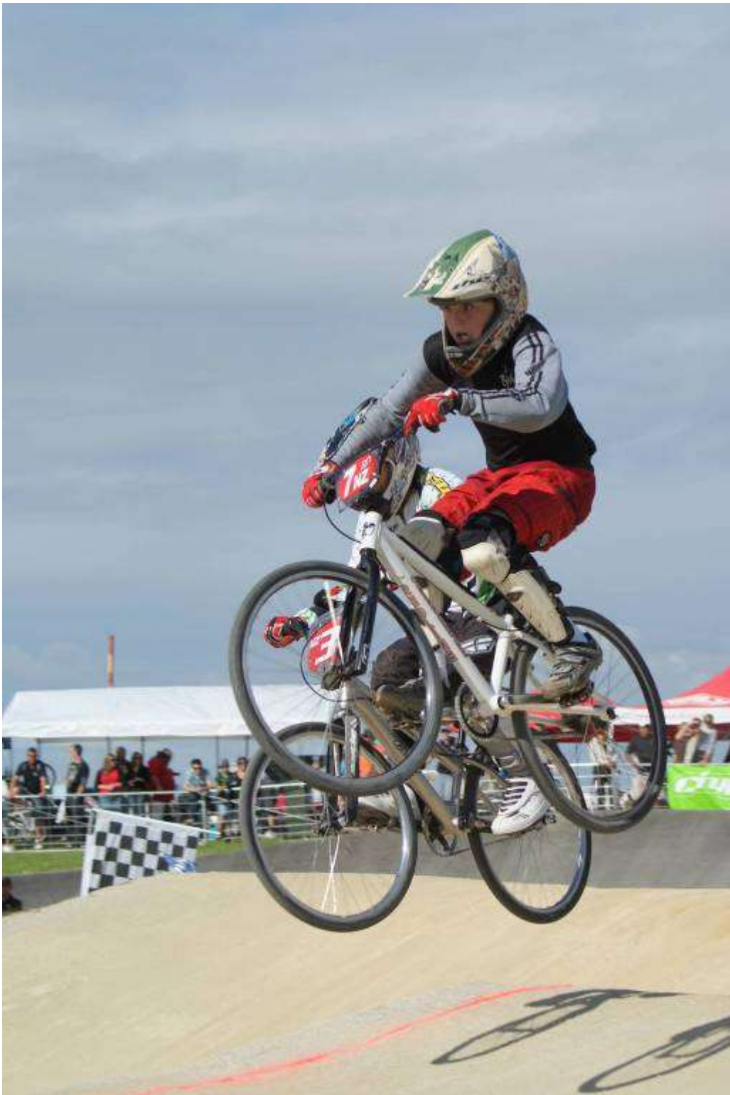
Action on the BMX track at William Fraser Memorial Park on Pohe Island (2009)