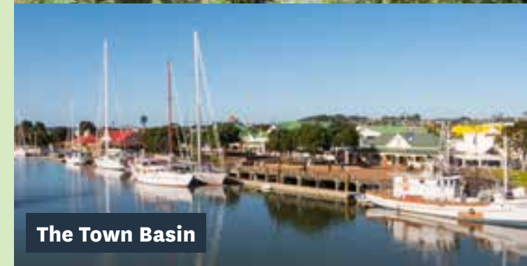
The Town Basin