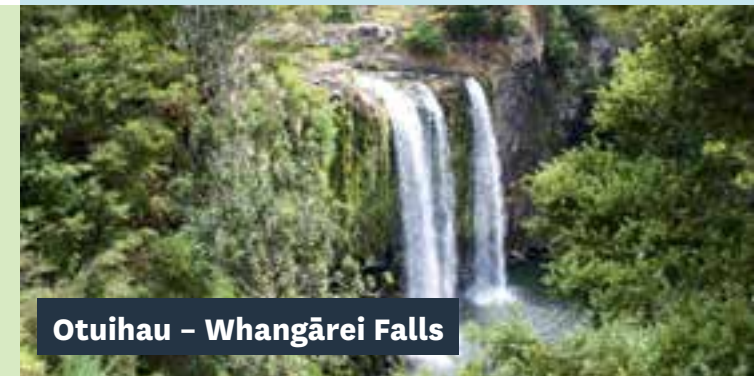
Otuihau – Whangārei Falls

This museum is the permanent home for the city art collection, that embraces heritage and contemporary art.