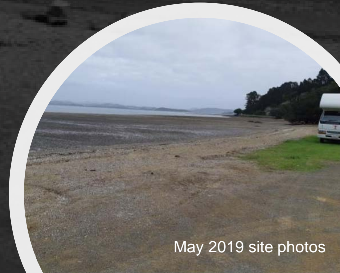
May 2019 site photos